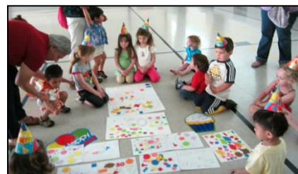
Participants in a recent Birthday Party Storytime at the library had some colorful fun.