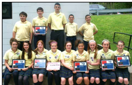
(Above) These St. Francis de Sales students recently swept first-place at the regional finals of the 2012 Computer Fair and are now headed to the state competition; (Below) The first-place students display their projects.