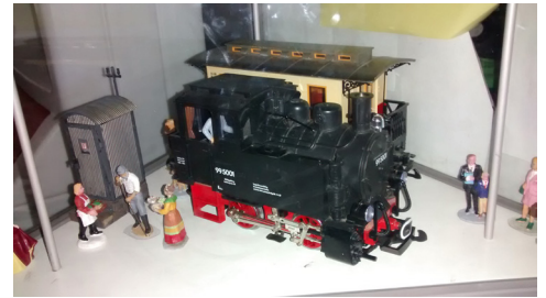
One of the trains on display at the Aston Library.

The Aston Public Library Board of Trustees' December meeting will be held at a special location, 9 Montgomery Lane. The meeting will be at 7 p.m. on Tuesday December 20. Join the Friends of the Library. Go to www.astonlibrary.org and click on "Join Our Friends" to send in your information.