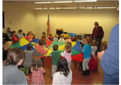
Makin' Music performs at the Library.