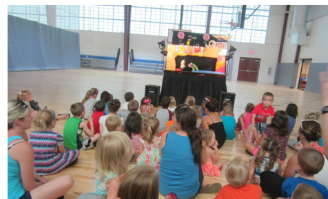
A previous Segal Puppets performance at our library

More information and registration for all of our programs is available via the