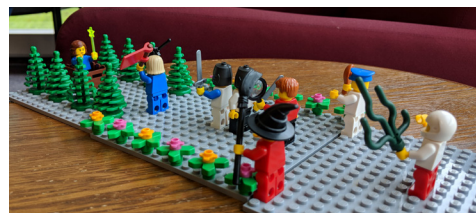
One of the Lego creations from the Kids Can Build group